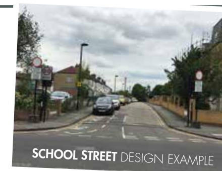
SCHOOL STREET DESIGN EXAMPLE

A school street reduces high levels of congestion outside schools by closing the road to all traffic at specific times except residents. The proposal is to close Tile Kiln Lane between 8.30 - 9.30am and 2.15 - 3.30pm to avoid traffic in the front of Oakthorpe School.